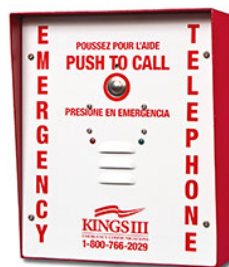
Pool & Exterior Help Phone

Pair the EC-1000 with our Wide Range of ADA Compliant Emergency Phone Hardware, Including: