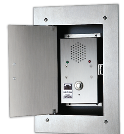
Surface Mount Elevator Phone